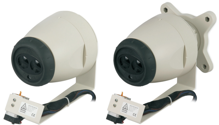
Anti-Condensation Heater with Detector Head