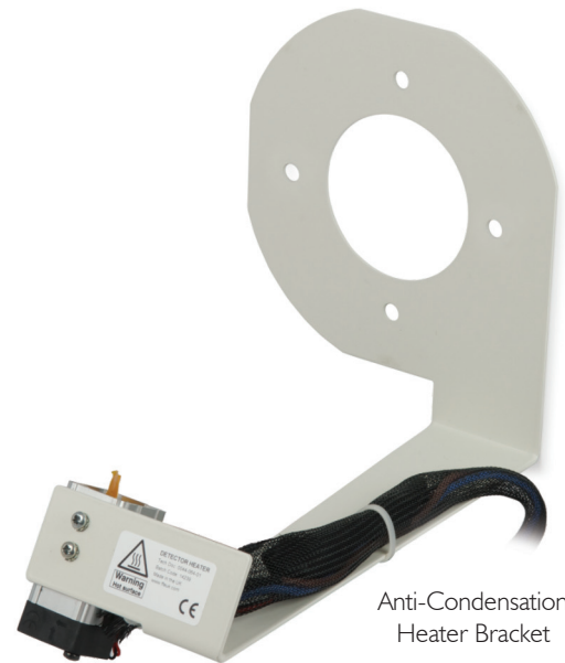
Anti-Condensation Heater Bracket

t +44 (0) 1462 444 740 e sales@ffeuk.com w www.ffeuk.com