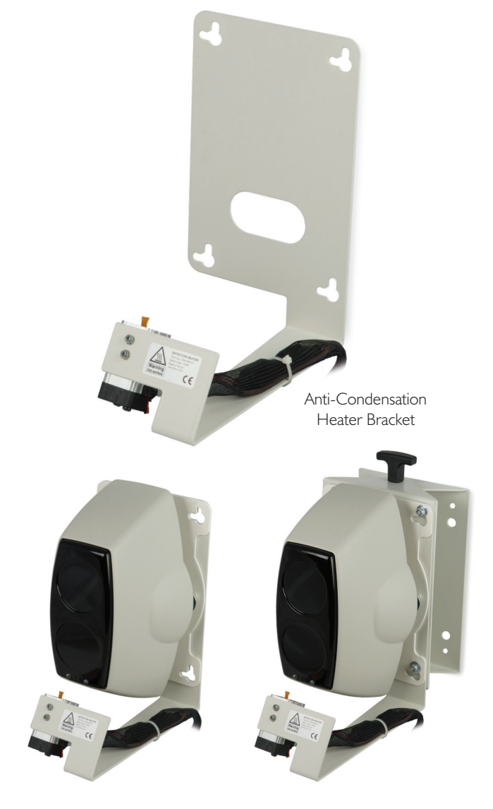
Anti-Condensation Heater with Detector

t +(859) 957-1570 e america@ffeus.com w www.ffeus.com