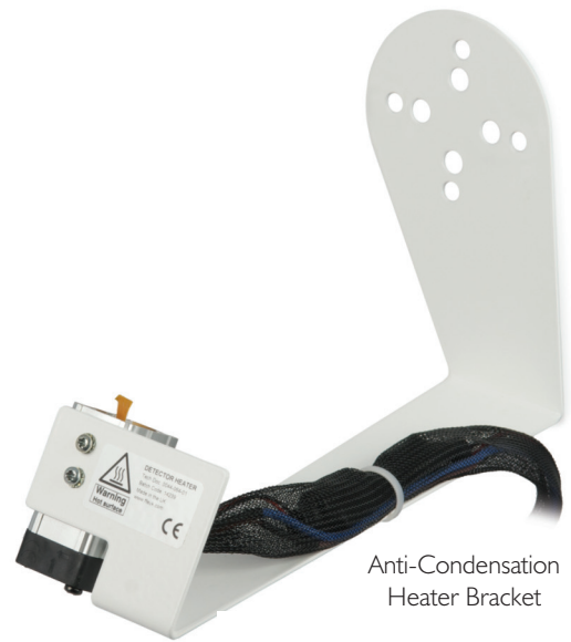
Anti-Condensation Heater Bracket