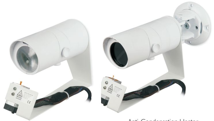
Anti-Condensation Heater with Transmitter