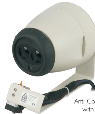
Anti-Condensation Heater with Detector Head