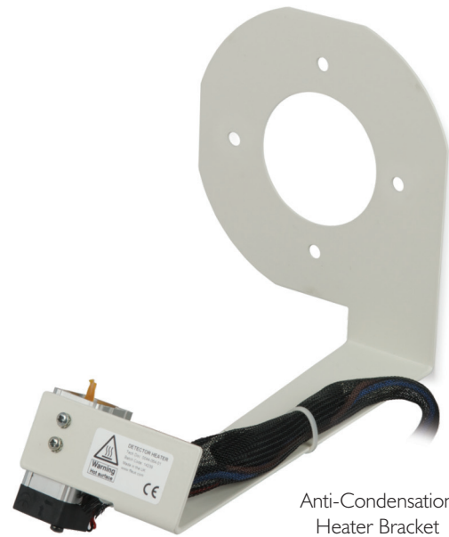
Anti-Condensation Heater Bracket